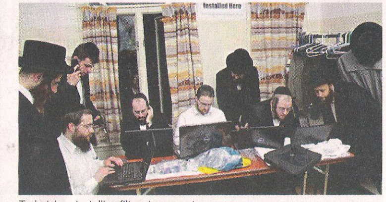
Technicians installing filters in computers.

The VCF brochure explains, "You won't have the option of