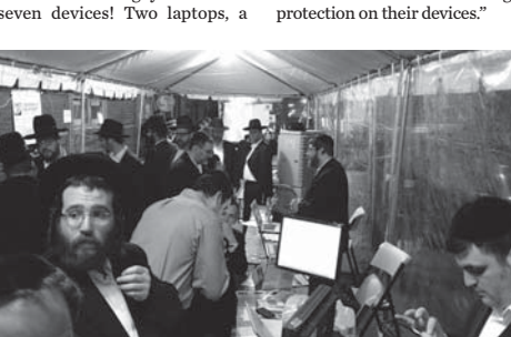
Talented computer technicians from our community volunteering at the Venishmartem Filterthon, where over 1,600 internet filters were installed on a gamut of devices.

Yaakov relates one event that expresses the effectiveness of the Filterthon: "One guy came with seven devices! Two laptops, a